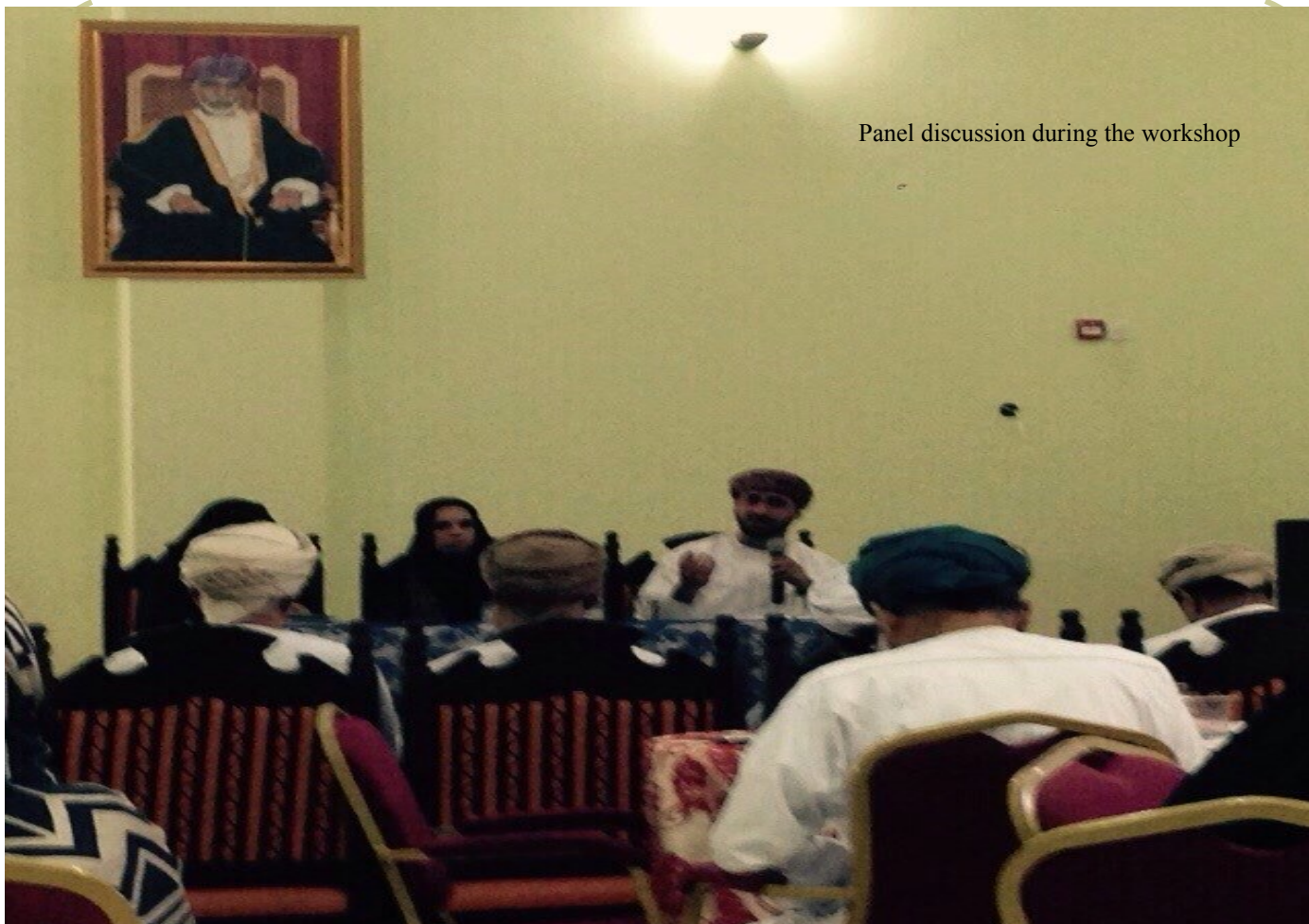
Panel discussion during the workshop