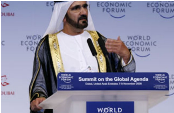
UAE Vice President, Prime Minister and Ruler of Dubai Sheikh Mohammed Bin Rashid Al-Maktoum, addresses the World Economic Forum in Dubai

UNFPA, the United Nations Population Fund, Executive Director, Dr. Babatunde Osotimehin participated at World Economic Forum (WEF) summit, held in Dubai during 7th to 12th of November, 2014. The Summit is considered as one of the world's largest global brainstorming events; bringing together the most relevant thought leaders of the WEF's Network of Global Agenda Councils. Comprised of more than 80 groups of experts from Academia, Business, Civil Society and Government, the Councils aim is to advance knowledge and jointly explore critical issues shaping the regional and global industrial agendas.