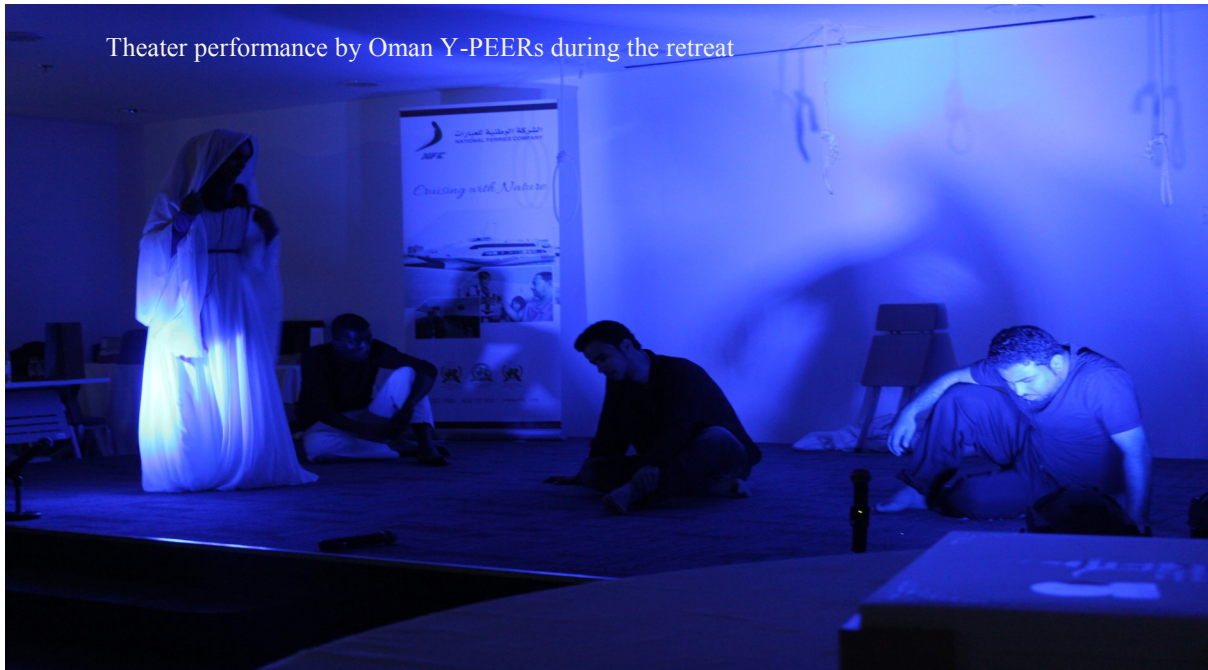
Theater performance by Oman Y-PEERs during the retreat

Each former and current Y-PEER member was given a certificate of appreciation by UNFPA with gifts of appreciation supported by various donors.