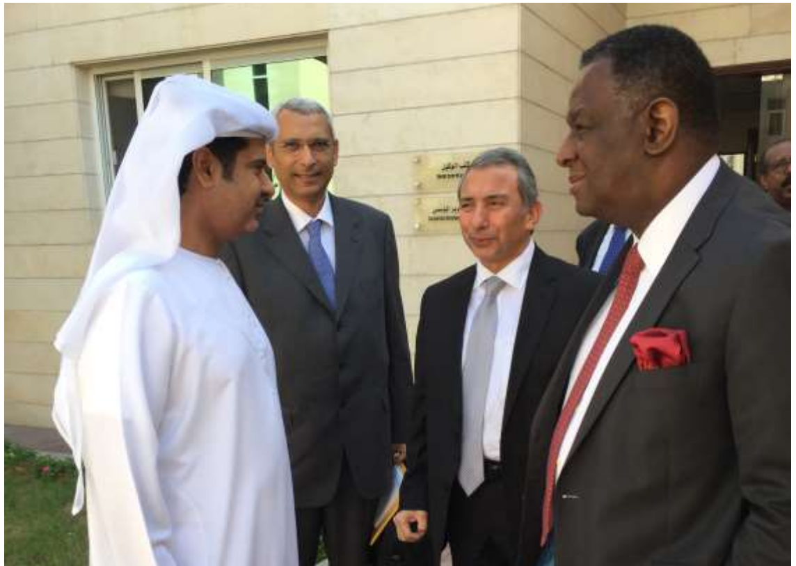
Dr. Babatunde Osotimehin- Executive Director at the 2015 World Economic Forum

“By focusing on human dignity and human capital, and by empowering a healthy, educated and skilled population, many young and emerging economies can reap the greatest economic and social gains.” said Dr. Osotimehin. He added that, “Where fertility is declining, many countries stand poised to benefit from a demographic dividend. As their young people move