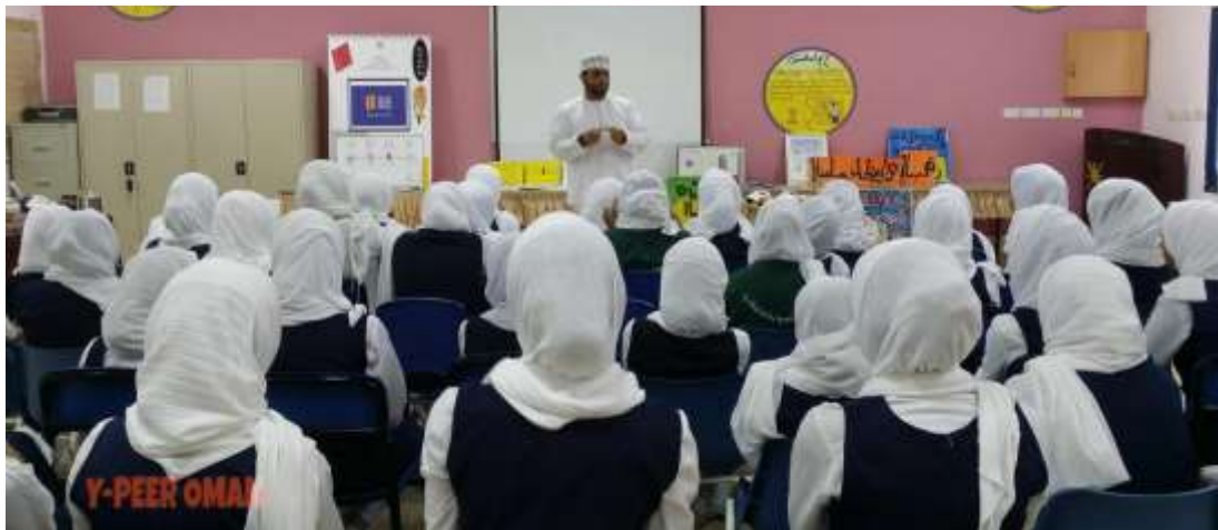
Y-PEER Oman leading HIV session

The aim of the campaign was to shed light on youth RH&R and needs. This campaign raised awareness through peer education sessions, street actions, concerts, fairs, trainings, advocacy in the media, and other activities in more than 25 countries in Eastern