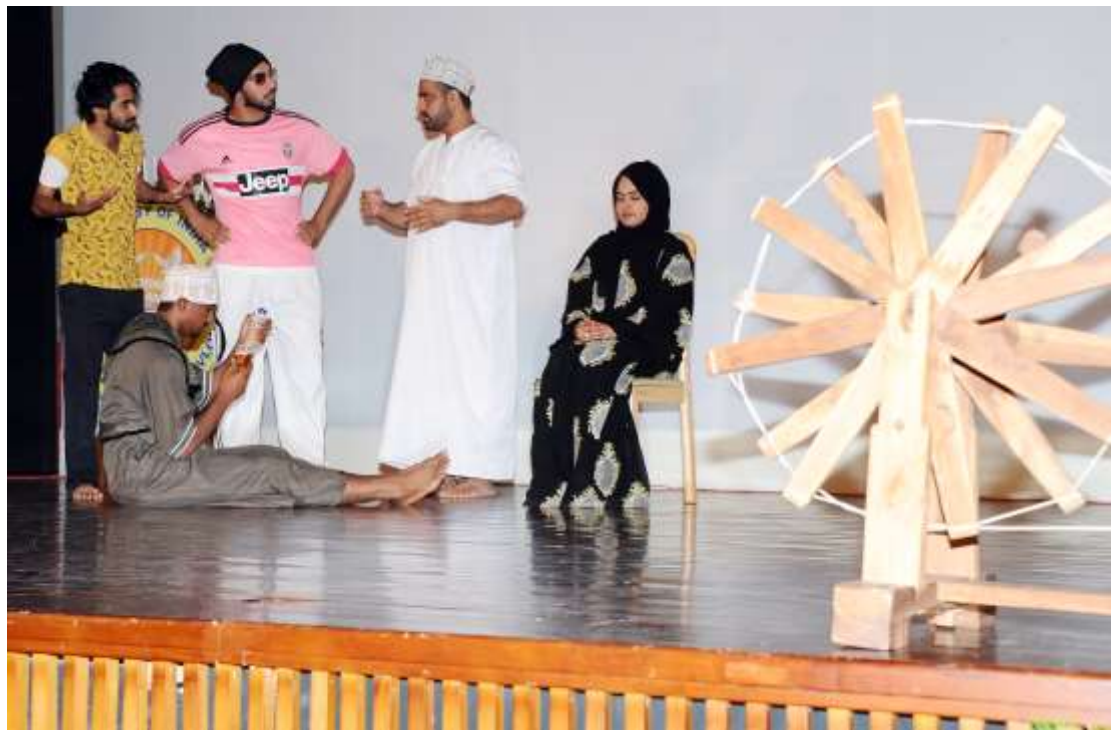
Y-PEER Oman at International Day of Non-Violence

Russian Federation, South Africa, Thailand, Iran, Kenya, Indonesia and representatives of the embassies of other countries, who joined the “Candle Lighting” ceremony on the stage.